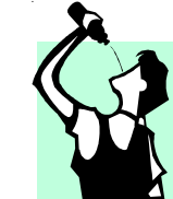
Water Stations at mile 3, 5, 9, 12

The Red Baron Half Marathon starts at the Corning Community College Commons at the top of Spencer Hill and takes the picturesque roads down the back side of the hill. There are no steep hills that would be rough on the knees; and yet, from start to finish, there is a gradual 800 foot drop in elevation. Local distance runners regard this course highly, and consider this a great race event.